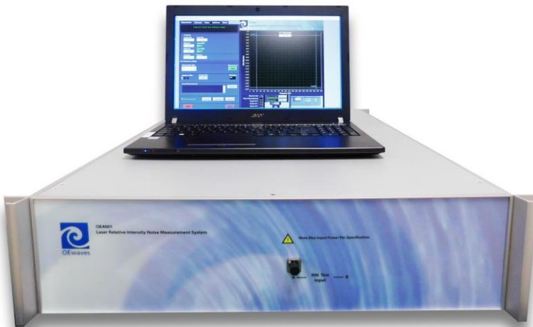
*Factory PC option shown

The OEwaves' HI-Q® OE4001 Relative Intensity Noise (RIN) Analyzer offers a fully automated measurement of ultra-low RIN CW laser sources.