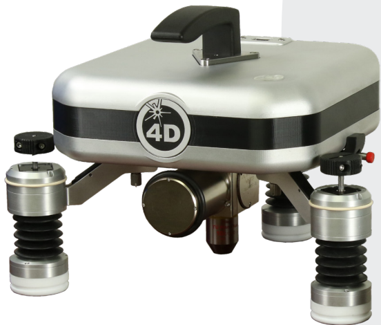
NanoCam HD with optional tripod

Utilizing a Linnik configuration, NanoCam HD interference objectives provide superior lateral resolution over a larger field of view with greater working distance and surface measurement fidelity than comparable Mirau objectives.